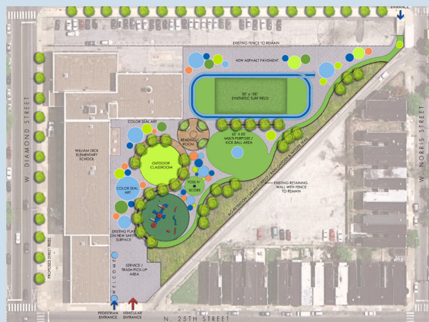
William Dick Elementary School conceptual schoolyard design