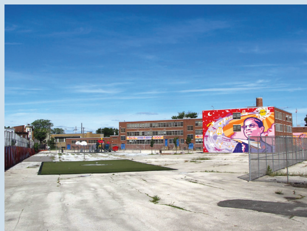
William Dick Elementary School

In a three-year pilot program, we will convert ten schoolyards and recreation centers into vibrant community spaces. Below, a design schematic shows a sample redesign of the schoolyard at William Dick Elementary School, one potential project site.